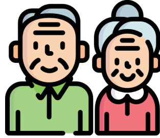
Grandparents / Elderly