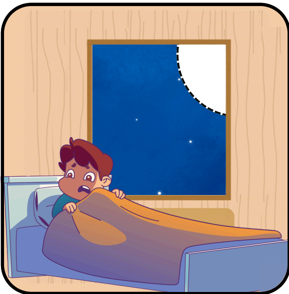
Help me be brave