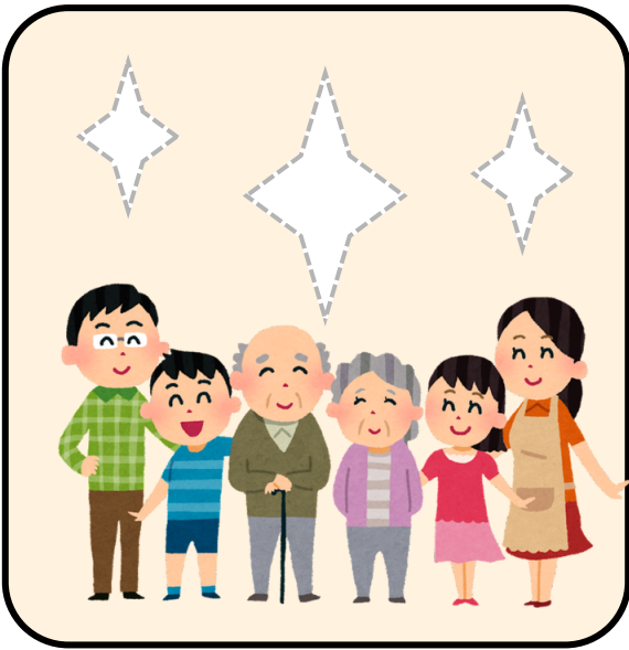
Bless my family