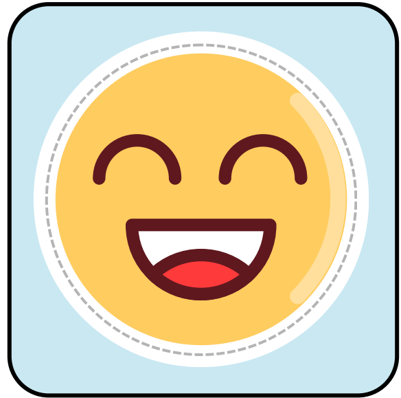
Give me joy