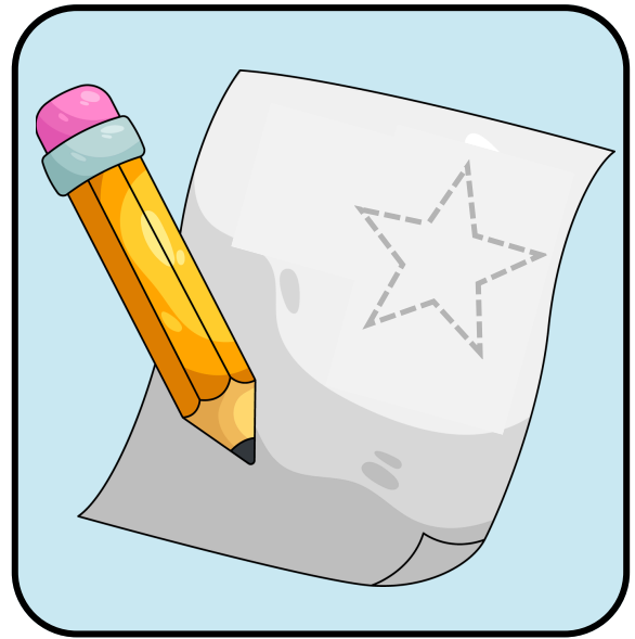
Help me in school