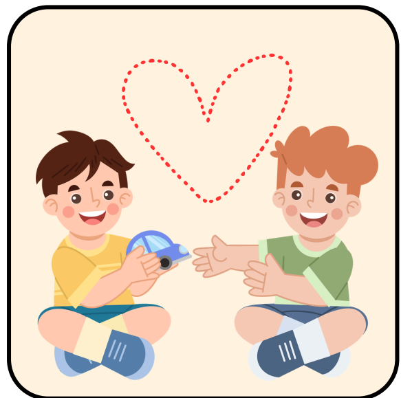
Teach me to love others