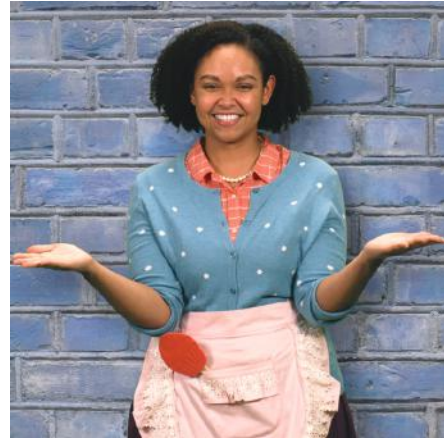
to each other."