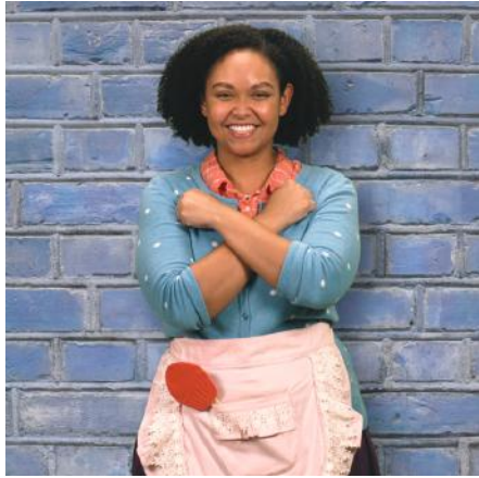
"Be kind and loving