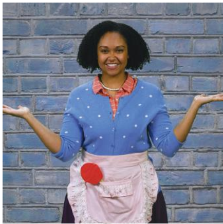
at all times."