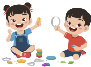
Sharing your toys